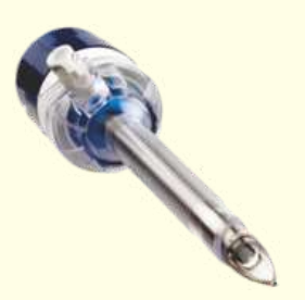
UL-3IVT optial Disposable Trocar