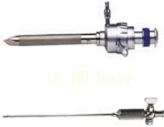
UL-3VN Veress Needle