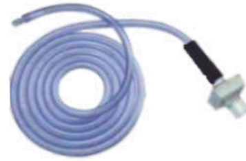
UL-3STM Tubing set

Insufflator Tube | Foot Switch | Insufflator Smoke Evacuation Tube | Insufflator Filters | Smoke Evacuation Filters | UHPA Filter | Humidifier Bottel