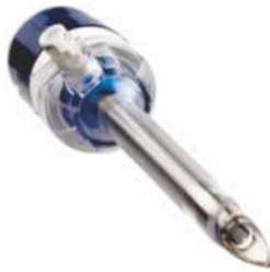
UL-3IVT optial Disposable Trocar